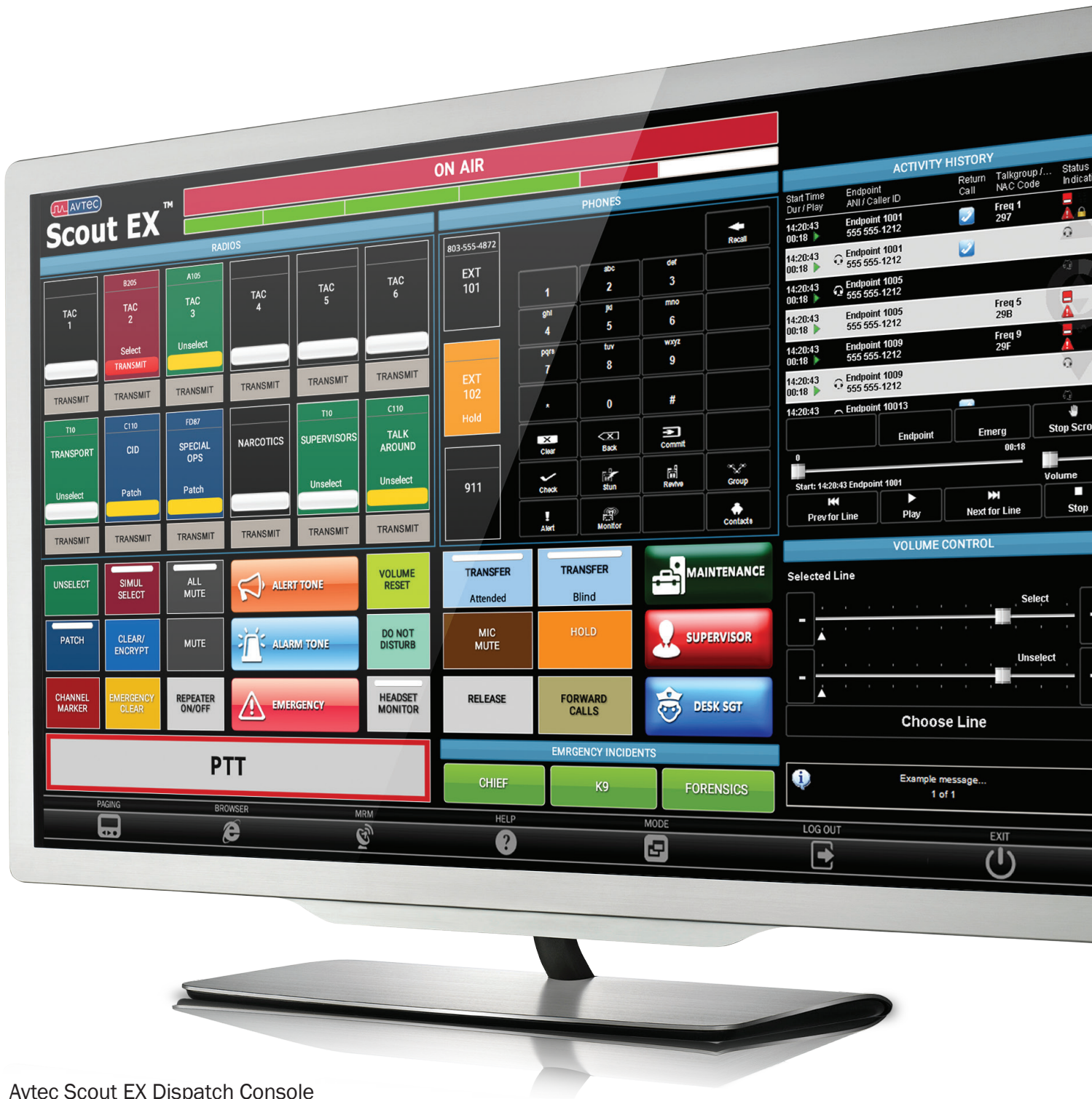
Avtec Scout EX Dispatch Console