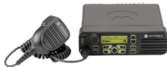
XPR 4000 Series

The Long Range Wireless Remote Speaker Microphone (RSM) pairs instantly with touch pairing to the mobile microphone with Bluetooth gateway. The Bluetooth microphone is compatible with MOTOTRBO XPR 4000 and XPR 5000 series mobile radios. The Long Range Wireless RSM works up to 100 meters away from the mobile radio, keeping you in communication where you never thought possible.