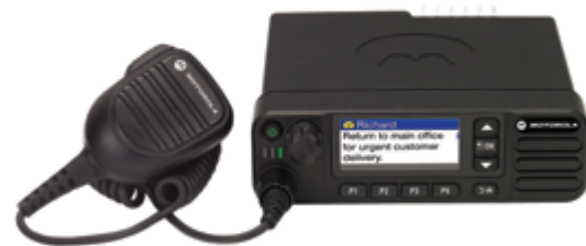
XPR 5000 SERIES

Connect your Bluetooth enabled MOTOTRBO XPR 5000 Series mobile radio to an Operations Critical Wireless earbud and wired, steering wheel mounted pushbutton PTT and you'll never have to take your hands off the wheel again.