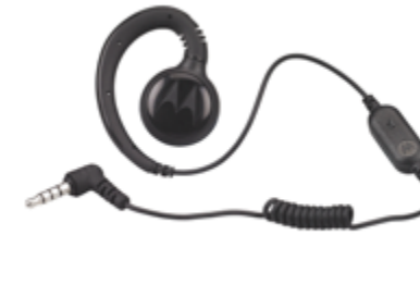
RLN6550A (Pack of 3)