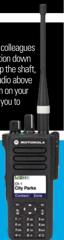
XPR 7000 SERIES

Connect your MOTOTRBO XPR 7550 portable radio with integrated Bluetooth to an intrinsically safe Operations Critical Wireless earpiece and you'll never be out of range underground again.