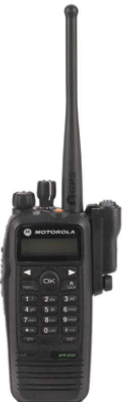
XPR 6000 SERIES with PMLN5993 (Bluetooth Touch Pairing Adapter)