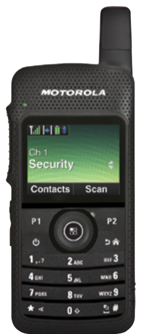
SL 7500 SERIES