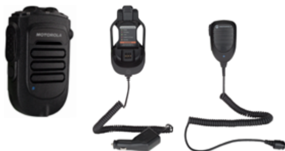
RLN6551 Long Range Wireless Remote Speaker Microphone Kit