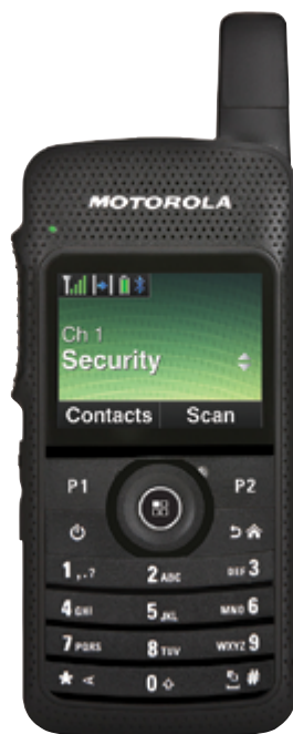
SL 7500 SERIES