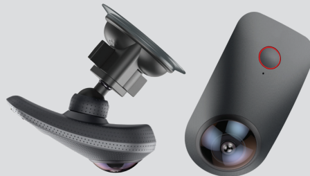
Sr600 In-Car Camera