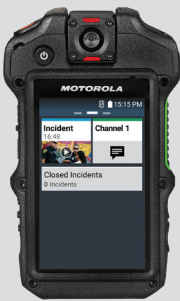
Si500 Body-Worn Camera

Our camera portfolio is designed to work seamlessly with CommandCentral Vault to help you renew trust. Learn more at motorolasolutions.com/trust .