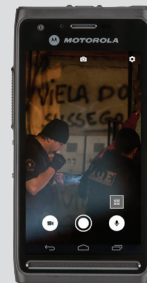
Capture Mobile Camera App

For more information about CommandCentral Vault, visit motorolasolutions.com/vault