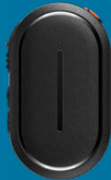
TLK 25 wearable WAVE PTX device