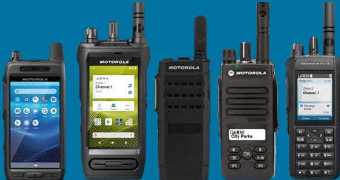
MOTOTRBO two-way radios and Evolve smart handheld