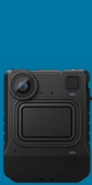
VB400 body camera

Providing clear and reliable video documentation alongside instant communication enables staff to quickly de-escalate situations, effectively respond to challenges including theft, coordinate tasks and ensure the well-being of both employees and students.