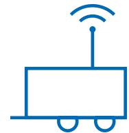
CELL ON WHEELS (COW)