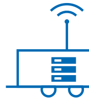
SYSTEM ON WHEELS (SOW)

To create a wider network, multiple COWs can be connected to a SOW.