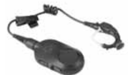
Operations Critical Wireless Earpiece

“When I first saw the MOTOTRBO SL Series I thought that it was a cell phone, not an actual two-way radio. It has all the capabilities of a two-way radio but with a professional, discreet look that fits absolutely well with all our uniforms.”