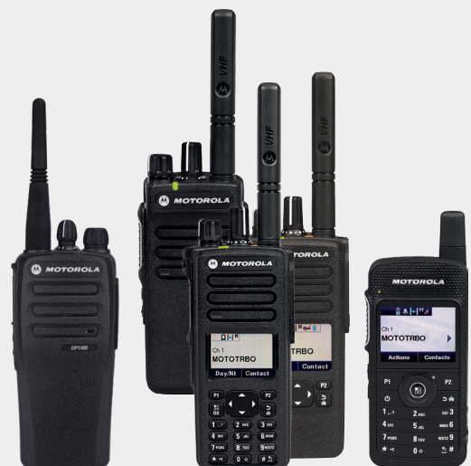
MOTOTRBO XiR P3688