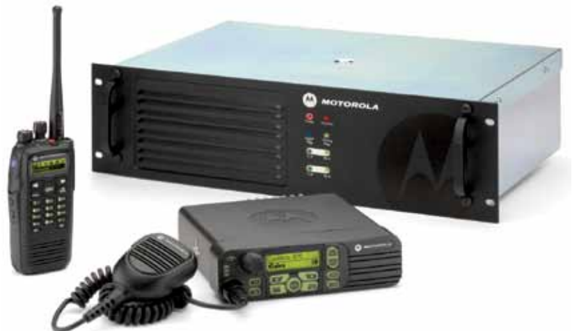
MOTOTRBO™ portable, mobile and repeater.

With an effective system to provide task management, track progress and improve responsiveness of their caregivers, healthcare providers can perform their work quickly and accurately, and avoid costly errors. They can enhance clinical performance and improve the delivery of patient care.