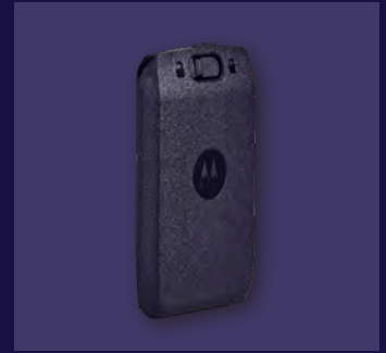
HKNN4013ASP01 BT90 STANDARD CAPACITY BATTERY