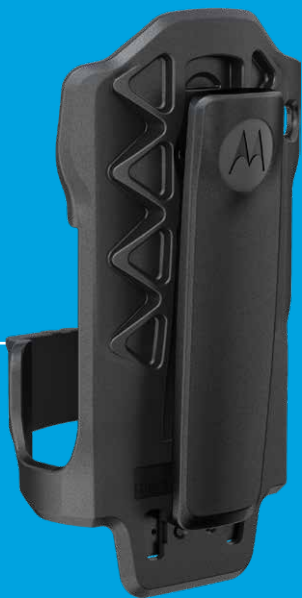
CLASSIC HOLSTER - BACK VIEW WITH 3" BELT CLIP (sold separately - see page 12)