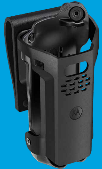
HYBRID LEATHER CARRY CASE