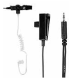
Two-Wire Surveillance Kit With Translucent Tube, Black