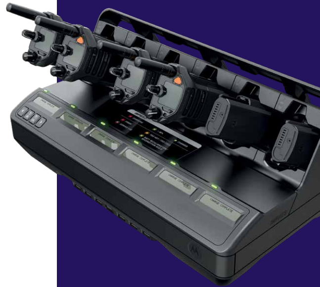
IMPRES 2 MULTI-UNIT CHARGER