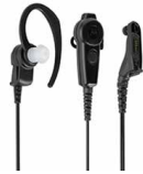
IMPRES Over-the-Ear Two-Wire Surveillance Kit, Black