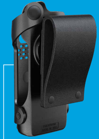
HYBRID LEATHER CARRY CASE - BACK VIEW (Swivel Belt Loop sold separately)

Standard clip slot present under D bracket