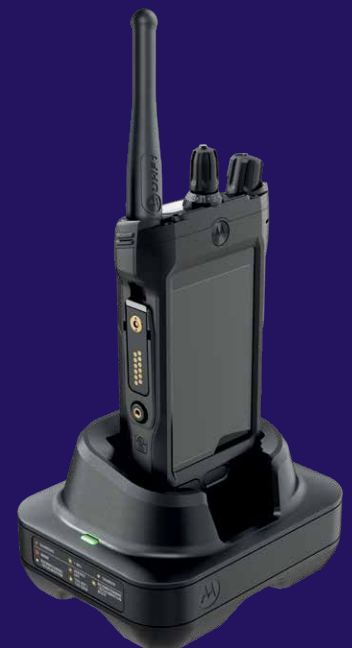
IMPRES 2 SINGLE-UNIT CHARGER