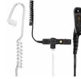
IMPRES Two-Wire Surveillance Kit, Black