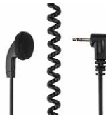
3.5 mm Receive-Only Earpiece with Covered Earbud