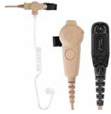
IMPRES™ Two-Wire Surveillance Kit, Beige