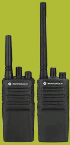
ON-SITE TWO-WAY BUSINESS RADIOS AND ACCESSORIES