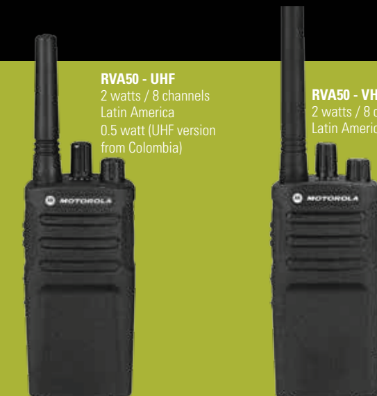
RVA50 - UHF 2 watts / 8 channels Latin America 0.5 watt (UHF version from Colombia)