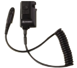
Ear Mic VOX/PPT Interface Module