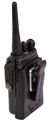
Plastic Carry Holder w/Belt-clip