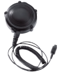
Remote Body PTT Switch for Ear Mic