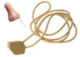
Wireless Discreet Earpiece