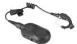
Operations Critical Wireless Earpiece

“When I first saw the MOTOTRBO SL Series I thought that it was a cell phone, not an actual two-way radio. It has all the capabilities of a two-way radio but with a professional, discreet look that fits absolutely well with all our uniforms.”