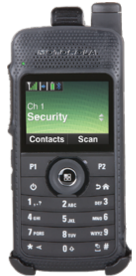
SL 7590 (900 MHz) SL Series Radio in Carry Holster Radio shown in "face out" position

The SL Series is backed by a two-year Standard Warranty (US and Canada) with a minimum one-year warranty on Motorola-branded accessories. Because accidents happen, Motorola recommends Service from the Start Comprehensive, which delivers accelerated turnaround on radio repairs (including physical, chemical and liquid damage) and even covers shipping costs. By reducing your downtime, Service from the Start Comprehensive helps you to lower your total cost of ownership and focus on your business operations, not your technology.