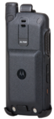
Carry Holster Radio shown in "face in" position

Our unique multi-unit charger merges high power with high image, too. You can charge six radios simultaneously and recharge a battery in the top slot whenever a radio is removed. This charger is both functional and sleek in design.