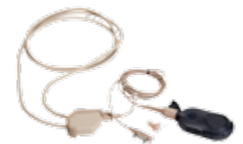
Wireless Completely Discreet Kit

"When I first saw the MOTOTRBO SL Series I thought that it was a cell phone, not an actual two-way radio. It has all the capabilities of a two-way radio but with a professional, discreet look that fits absolutely well with all our uniforms."