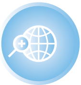
MOTOTRBO Location Services