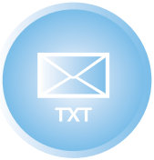
MOTOTRBO Text Messaging Services