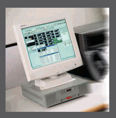
Designed with your needs – and your center's needs in mind

Like to learn more about how CENTRACOM Elite can take your dispatch center to the frontiers of service, productivity and reliability? Contact your Motorola representative -- or call toll free 888-567-7347 It's the call that will connect you to the future of dispatch control centers. From Motorola, of course.