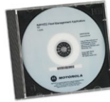
NNTN7676 IMPRES Battery Fleet Management Software

The software application remotely downloads key IMPRES battery data through existing IMPRES chargers for more effective management of the IMPRES battery and charger fleet. These reports provide key battery and charger data such as when IMPRES batteries are nearing end of life, identifying lost batteries and ensuring IMPRES chargers are appropriately distributed and use is maximized.