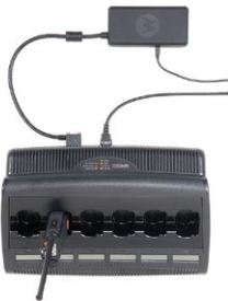
NNTN7677 Multi-Unit Charger Interface Unit, attaches to an APX, XTS, MOTOTRBO and Professional Series IMPRES multi-unit charger to enable the data transfer to IMPRES Battery Fleet Management. A CIU is required for IMPRES chargers that report data to IMPRES Battery Fleet Management.