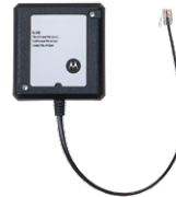
NNTN8045 Single-Unit Charger Interface Unit , attaches to an APX, MOTOTRBO and Professional Series IMPRES single-unit charger to enable the data transfer to IMPRES Battery Fleet Management. A CIU is required for IMPRES chargers that report data to the IMPRES Battery Fleet Management.