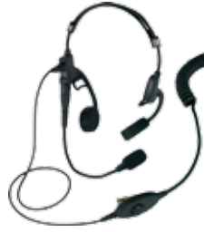
PMLN5101 1 IMPRES Temple Transducer with boom microphone and in-line push-to-talk button

This headset allows you to receive audio without covering the ear, allowing users to have their ears open to all external sounds such as warning and fire alarms, machinery and outside traffic. You can also wear hearing protection and still use this Temple Transducer since you are hearing through bone vibrations on your temple.