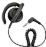
WADN4190 Receive-Only Flexible Earpiece