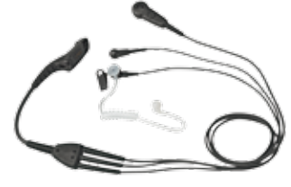
PMLN5111' IMPRES 3-Wire Surveillance Kit with Translucent Tube, black PMLN5112' IMPRES 3-Wire Surveillance Kit with Translucent Tube, beige