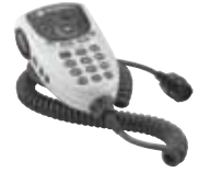
RMN5065 IMPRES Keypad Microphone

IMPRES Keypad Microphone includes a full keypad that enables you to dial phone numbers from the microphone, also has three customizable buttons that can be programmed with any of the control head features, allowing the user to navigate radio menus from the microphone.