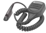
PMMN4040 1 Remote Speaker Microphone, Submersible (IP57)