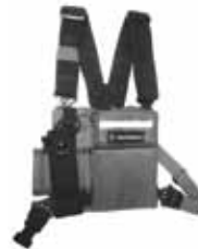
RLN4570 Break-a-Way Chest Pack with Radio Holder, Pen Holder and Velcro Secured Pouch