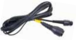
PMKN4033 10-foot Mobile Microphone Extension Cable PMKN4034 20-foot Mobile Microphone Extension Cable