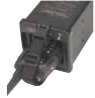
NNTN7616 IMPRES Compatible Vehicular Charger

This charger has a full IMPRES charger to battery communication capability. This ensures continuity of IMPRES battery charge data logging in a vehicular environment, so the IMPRES battery will receive adaptive automatic reconditioning and will qualify for the 6-month capacity warranty extension.