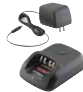
WPLN4232 IMPRES Single-Unit Charger, 120 Volt

This smart energy system automatically reconditions IMPRES batteries based on actual usage, keeping them in peak condition. Talk-time and cycle life are optimized and the need for manual maintenance programs is eliminated. Its advanced conditioning features allow batteries to be safely left on the charger for extended periods of time without incurring damaging heat build-up which can decrease battery cycle life. In addition, batteries left in the charger are kept fully charged so they are always ready when needed. This rapid-rate, tri-chemistry charging system will also charge compatible non-IMPRES batteries.