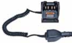
RLN6433 Motorola Travel Charger

Its small compact design allows the radio to be used while rapid charging in the charger base. Unit includes a voltage regulated vehicular charger adapter, custom charger base, mounting bracket and coil cord.