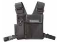
HLN6602 Universal Chest Pack with Radio Holder, Pen Holder and Velcro Secured Pouch

Motorola Original Universal Chest Pack protects the radio and provides the freedom from holding it during standby communication mode. The Motorola Universal Chest Pack fits any radio.