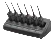
WPLN4219 IMPRES Multi-Unit Charger with Displays

Charger Displays provide powerful, "real time" information for IMPRES batteries, including current charge status, battery mAh, and voltage. Readout displays battery kit number, serial number and chemistry. 120 Volt.