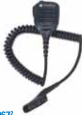
PMMN4067 2 IMPRES Remote Speaker Microphone (CSA and IP64)