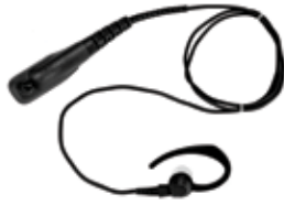
RLN5878' Receive-Only Earpiece, black RLN5879' Receive-Only Earpiece, beige

Simple, cost-effective solution when discreet communications is needed. Privately receive messages with the earpiece.