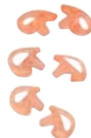
RLN4760 Small Custom Earpiece - Right Ear RLN4761 Medium Custom Earpiece - Right Ear RLN4762 Large Custom Earpiece - Right Ear RLN4763 Small Custom Earpiece - Left Ear RLN4764 Medium Custom Earpiece - Left Ear RLN4765 Large Custom Earpiece - Left Ear