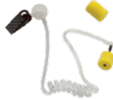
RLN5887 Extreme Noise Kit, includes 2 foam earplugs. For high-noise environments (Noise Reduction = 24dB)