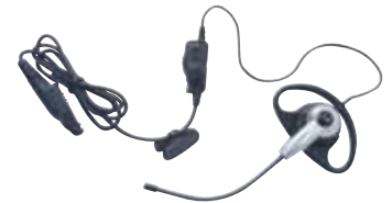
PMLN5096 1 D-Style Earset with In-Line push-to-talk