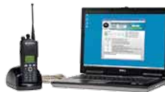
NNTN7392 IMPRES Battery Reader

The industry exclusive IMPRES Battery Reader provides IMPRES battery users the ability to access charging, reconditioning and key usage data that can affect overall battery performance. By keeping batteries in peak condition, talk time and cycle life are optimized, reducing battery replacement. Package includes IMPRES Battery Reader (fits XTS batteries), System Software, USB Cord, Adapter inserts for APX, MOTOTRBO and Professional Series radios.