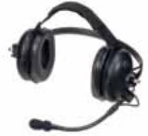
PMLN5275 1 Heavy Duty Headset, Noise Reduction = 24dB

Designed for rugged use in noisy environments where hearing protection is required. This dual-muff headset includes flexible noise-canceling boom microphone with a push-to-talk switch located on the earcup. This can be worn with or without a helmet.