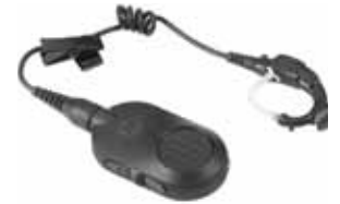
NNTN8126 Operations Critical Wireless Earpiece with 9.5 inch cable. Includes micro USB charger.