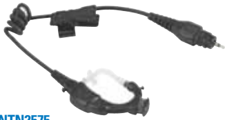
NTN2575 Replacement Wireless Earpiece, 9.5 Inch Cord