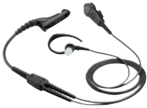
RLN5880' IMPRES 2-Wire Surveillance Kit, black RLN5881' IMPRES 2-Wire Surveillance Kit, beige

2-Wire kits include one wire for receiving and one wire for the microphone. 3-Wire kits include one wire for receiving, one wire for the microphone and one wire for the push-to-talk.