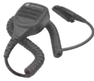
PMMN4024 1 Remote Speaker Microphone with 3.5mm Audio Jack (IP54)

The windporting feature dramatically lessens background noise from high winds and other severe weather conditions. The same technology helps prevent water from clogging the microphone port and distorting transmit audio, ensuring a user's confidence of clear communication.