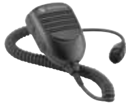
RMN5053 IMPRES Heavy-Duty Microphone

Heavy-Duty Microphone for users who want more durability, also ideal for those who need a larger microphone that is easier to handle when wearing gloves.