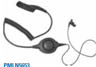
PMLN5653 IMPRES Ear Microphone with large protected ring around push-to-talk

Lightweight earpiece that picks up sound through bone vibration. A built-in bone conduction microphone and receiver eliminate the need for a boom microphone. A programmable button is available for quick access to radio features.