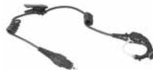
NTN2572 Replacement Wireless Earpiece, 12 inch cable