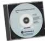
NNTN7676 IMPRES Battery Fleet Management Software

The industry exclusive IMPRES Battery Fleet Management software remotely downloads key IMPRES battery data through existing IMPRES chargers for more effective management of the IMPRES battery and charger fleet. These reports provide key battery and charger data such as when IMPRES batteries are nearing end of life, identifying lost batteries and ensuring IMPRES chargers are appropriately distributed and use is maximized.