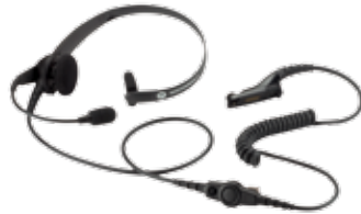
RMN5058 1 Lightweight Headset, over-the-head, single-muff with in-line push-to-talk

Provides high-clarity, hands-free discreet two-way communication, while maintaining the comfort necessary for extended wear in moderate noise environments. This single-muff adjustable headset comes with rotating boom microphone for left or right positioning. Includes an in-line push-to-talk button.