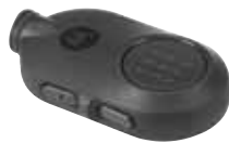
NNTN8127 Wireless Push-to-Talk Pod. This pod is compatible with any wireless Bluetooth headset and provides wireless Push-to-Talk functionality. Also comes with a micro USB charger.