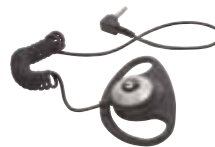
PMLN4620 1 Receive-Only D-Shell Earpiece