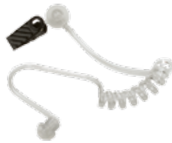
RLN5886 Low Noise Kit, includes 1 clear rubber eartip. For low-noise environments (does not provide hearing protection)

Provide extra comfort and noise protection for users wearing surveillance accessories. Lightweight, translucent tube attaches to the surveillance accessory to provide flexibility and comfort, while clothing clip prevents accessory from being pulled from the ear. For optimal performance, extra loud earphones are recommended for noise kits.