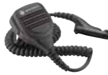
PMMN4025 1 IMPRES Remote Speaker Microphone with 3.5mm Audio Jack and Emergency Button (IP54)