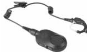
NNTN8125 Operations Critical Wireless Earpiece with 12 inch cable. Includes micro USB charger.