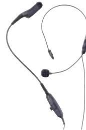
PMLN5102 1 Ultra-Lite Headset, Behind-the-Head Single-Muff, Adjustable with In-Line push-to-talk