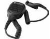
PMMN4050 1 IMPRES Remote Speaker Microphone with 3.5mm Audio Jack (IP54)

This remote speaker microphone features a noise cancelling directional microphone which helps eliminate ambient noise and is beneficial in high noise environments. It also has a large housing for users operating with gloves or in rugged environments.