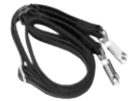
NTN5243 Adjustable, Black Nylon Carrying Strap. Attaches to D-ring on cases.