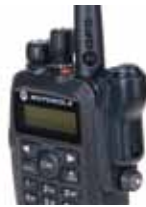
PMLN5712 Operations Critical Wireless Adapter. Must be attached to the MOTOTRBO Accessory connector to operate a wireless accessory.

Ruggedly reliable and Bluetooth® compatible, our progressive portfolio ranges from lightweight, high-performing earpieces to a wireless push-to-talk (PTT) you can put in a pocket and link to any earpiece.