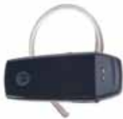
89409N HK200 Bluetooth Earpiece