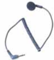
AARLN4885 1 Receive-Only Covered Earbud with Coiled Cord

These accessories allow users to receive audio discreetly. Any of the above microphones that have a 3.5mm audio jack are compatible with the following earpieces: