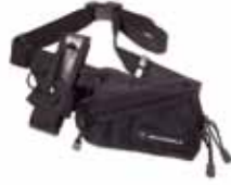
RLN4815 RadioPAK Radio Utility Case

The RadioPAK is lightweight and comfortable. Worn around the waist, it keeps radios and phones at hand. It features a separate 6 x 8 inch zippered pouch for other on-the-job necessities. Adjustable woven nylon belt fits both men and women.