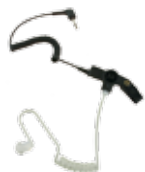
RLN4941 1 Receive-Only Earpiece with Translucent Tube and Rubber Eartip