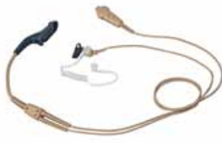
RLN5882' IMPRES 2-Wire Surveillance Kit with Translucent Tube, black RLN5883' IMPRES 2-Wire Surveillance Kit with Translucent Tube, beige