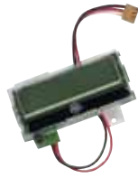
RLN5382 Display Module for IMPRES Multi-Unit Charger (WPLN4212)

This module is compatible with the standard IMPRES Multi-Unit Chargers. Up to 6 modules can be used per charger, one for each charging pocket. Includes detailed installation instructions.