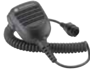
RMN5052 Standard Compact Microphone

Standard Compact Microphone provides basic push-to-talk functionality and ships with all MOTOTRBO mobile radios.