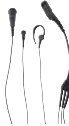
PMLN5097' IMPRES 3-Wire Surveillance Kit, black PMLN5106' IMPRES 3-Wire Surveillance Kit, beige