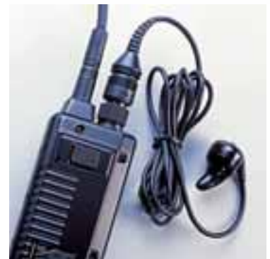
AZRMN4045 & BDN6677 (VOX/PTT Interface module shown with Ear Mic)