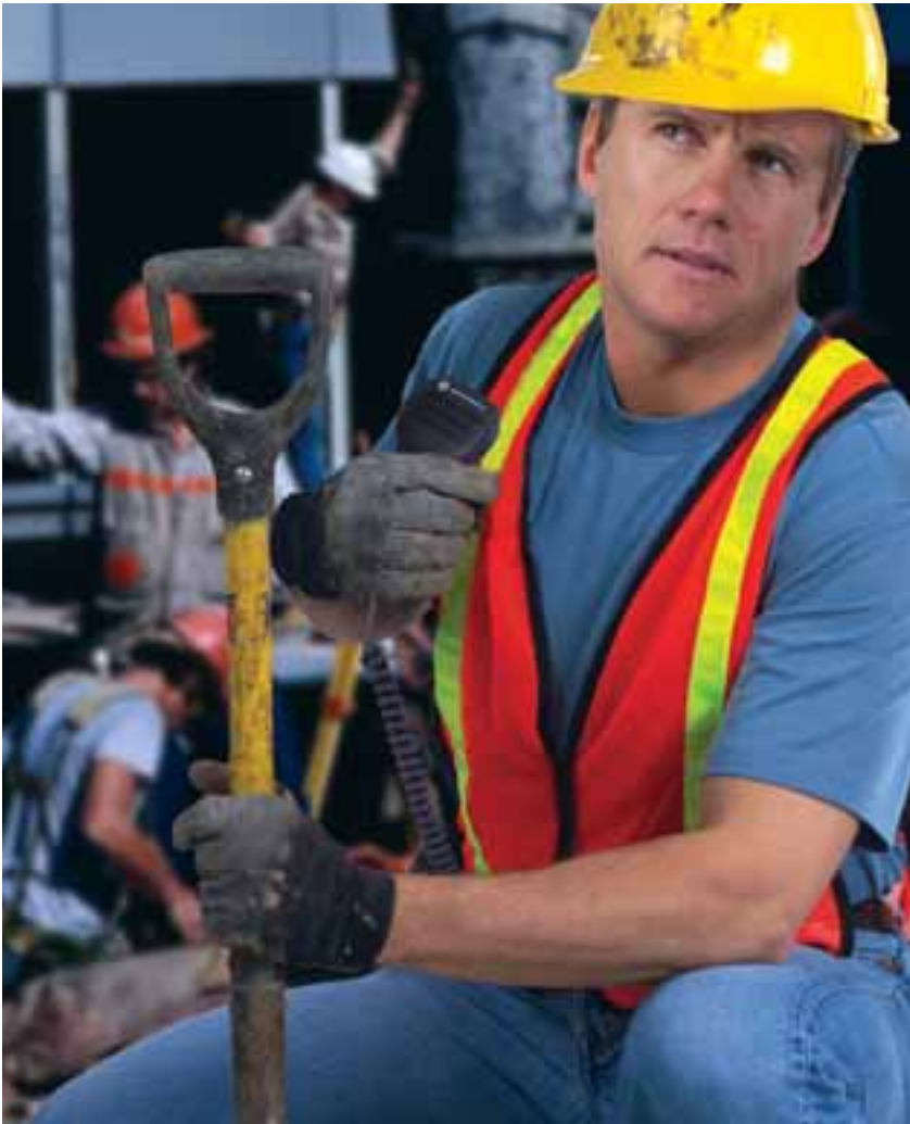
PMMN4021 Remote Speaker Microphone