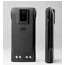
PMNN4023* (not shown with clip)