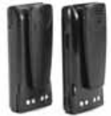
PMNN4008* shown with belt clip HLN9714 (order separately)

Part Number HNN4003 Capacity/Size: Ultra-High / standard Avg mAH: 2000mAH Dimension : 55 x 125 x 23 mm