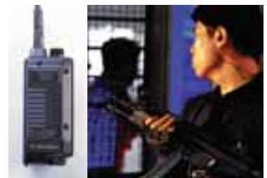
AZRMN4045 (VOX/PTT Interface module)