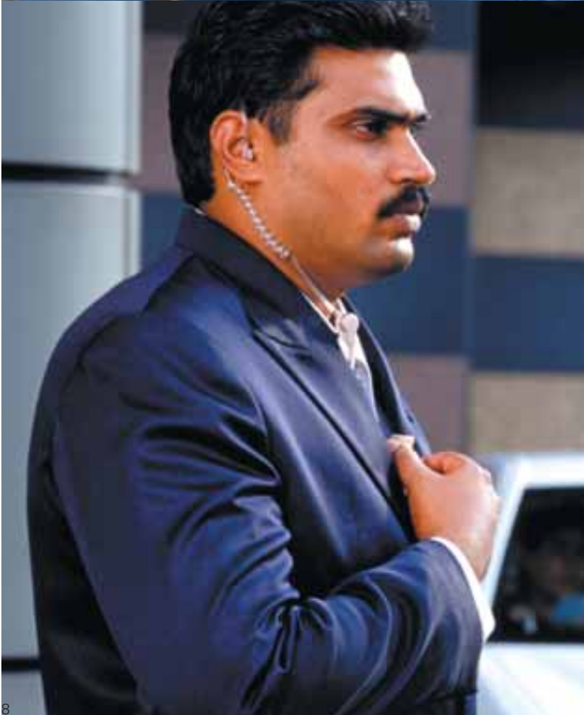
AZRMN4022 2-wire Surveillance kit