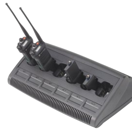
NNTN7065 IMPRES Multi-Unit Charger

Ensures maximum talk-time and optimized battery cycle life. Automatically reconditions IMPRES batteries based on actual usage, keeping them in peak condition. These rapid rate 6-unit chargers are available with or without a display. Display modules provide powerful analyzing information, such as current charge status and actual battery capacity in mAh. All APX radios and batteries are compatible with these chargers.