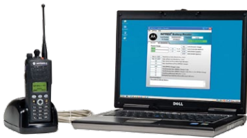
NNTN7392 IMPRES Battery Reader

The industry exclusive IMPRES Battery Reader provides IMPRES battery users the ability to access charging, reconditioning and key usage data that can affect overall battery performance. By keeping batteries in peak condition, talk time and cycle life are optimized, reducing battery replacement. Package includes IMPRES Battery Reader, system software, USB cord and adapter inserts for APX, MOTOTRBO and Professional Series radios.