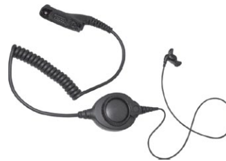
PMLN5653 IMPRES Ear Microphone System with large, protected ring push-to-talk button and one programmable button

Lightweight earpiece that picks up sound through bone vibration. A built-in bone conduction microphone and receiver eliminate the need for a boom microphone.