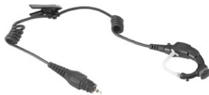
NTN2572 Replacement Wireless Earpiece, 12.5" cable