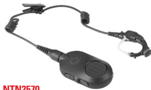
NTN2570 Mission Critical Wireless Earpiece with 12.5" cable