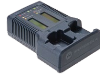
NNTN7593 IMPRES Dual-Unit Charger with Display Modules