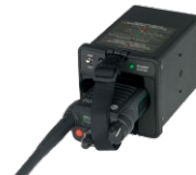
NNTN7624 IMPRES Vehicular Charger

NOTE: The IMPRES compatible vehicular charger will not recondition IMPRES batteries while in a vehicle, but it will provide an indication when reconditioning is required in an IMPRES desktop charger.