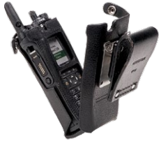
PMLN5560 APX 7000 Dual Display Portable Leather Flip Carry Case for NNTN7038, PMNN4403, NNTN8092 batteries

This new innovative carry case is designed to allow users to flip down the carry case to view the radio display and operate the radio keys without having to remove the radio from the belt. Users access key information while on the go and the radio remains protected in its case. This case is constructed of top-grain leather designed to withstand the harsh conditions of public safety use.