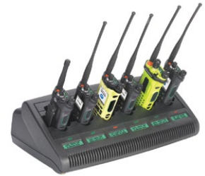
NNTN7073 IMPRES Multi-Unit Charger with Display Modules