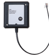
NNTN8045 Single-Unit Charger Interface Unit , attaches to an APX, MOTOTRBO and Professional Series IMPRES single-unit charger to enable the data transfer to IMPRES Battery Fleet Management. A CIU is required for IMPRES chargers that report data to the IMPRES Battery Fleet Management.