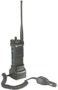
RLN6434 APX Travel Charger

Its small compact design allows the radio to be used while rapid charging in the charger base. Unit includes a voltage regulated vehicular charger adapter, custom charger base, mounting bracket and coil cord.