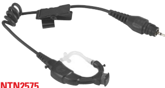
NTN2575 Replacement Wireless Earpiece, 9" cable