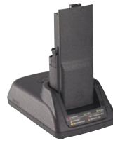
NNTN7080 IMPRES Single-Unit Charger

Ensures maximum talk time and optimized battery cycle life. Automatically reconditions IMPRES batteries based on actual usage, keeping them in peak condition. This is a compact, rapid rate, cost-effective charging solution. All APX radios and batteries are compatible with this charger.