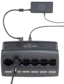
NNTN7677 Multi-Unit Charger Interface Unit, attaches to an APX, XTS, MOTOTRBO and Professional Series IMPRES multi-unit charger to enable the data transfer to IMPRES Battery Fleet Management. A CIU is required for IMPRES chargers that report data to IMPRES Battery Fleet Management.