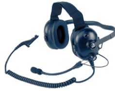
PMLN5275 Heavy Duty Headset, Noise Reduction = 24dB*

Designed for rugged use in noisy environments where hearing protection is required. This dual-muff headset includes flexible noise-canceling boom microphone with a push-to-talk switch located on the earcup. This can be worn with or without a helmet.