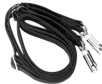
NTN5243 Adjustable Carrying Strap