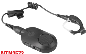
NTN2573 Mission Critical Wireless Earpiece with 9" cable

This earpiece is designed specifically for first responders. Seamless, streamlined and encrypted with strong 128 bit keys. This lightweight earpiece can be worn comfortably for long shifts common in public safety and performs well in loud environments.