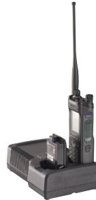
NNTN7586 IMPRES Dual-Unit Charger

APX IMPRES Dual-Unit Chargers provide public safety personnel the convenience of a spare battery that is charged and ready to be used at all times. This dual pocket design allows simultaneous charging of primary and secondary batteries. This Next Generation IMPRES charger provides advanced features, including the ability to turn on/off reconditioning, reduced reconditioning time and improved energy efficiency. These rapid rate chargers are available with or without a display and are compatible with all APX radios and batteries.