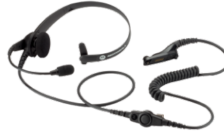
RMN5058 Lightweight Headset, over-the-head, single-muff with in-line push-to-talk*

Provides high-clarity, hands-free discreet two-way communication, while maintaining the comfort necessary for extended wear in moderate noise environments. This single-muff adjustable headset comes with rotating boom microphone for left or right positioning. Includes an in-line push-to-talk button.