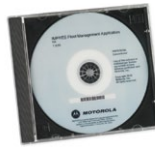
NNTN7676 IMPRES Battery Fleet Management Software

The software application remotely downloads key IMPRES battery data through existing IMPRES chargers for more effective management of the IMPRES battery and charger fleet. These reports provide key battery and charger data such as when IMPRES batteries are nearing end of life, identifying lost batteries and ensuring IMPRES chargers are appropriately distributed and use is maximized.