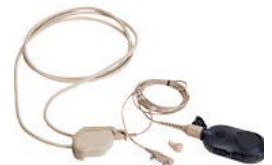
Wireless Completely Discreet Kit

“When I first saw the MOTOTRBO SL Series I thought that it was a cell phone, not an actual two-way radio. It has all the capabilities of a two-way radio but with a professional, discreet look that fits absolutely well with all our uniforms.”