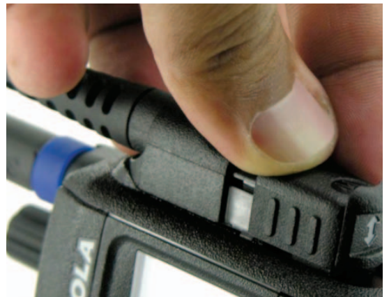
Connector can be detached with one hand in less than two seconds.