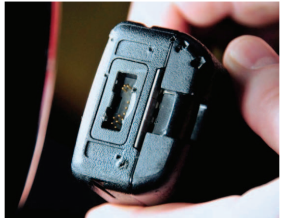
Image shows the bottom of a prototype radio after being dropped onto a bed of nails many times. You can see where the nails have impacted on the radio without bending the pins.

The combination of these two new connectors is a step-up in the ruggedness of the radio, the connectors resist all types of abuse including dirt, rough handling, and long-term corrosion. The fast changing side connector will be a big plus for users who change accessories frequently, sometimes in the dark or underneath clothing. Taken together these connectors greatly enhance the users experience of the MTP3000 Series TETRA Radio.