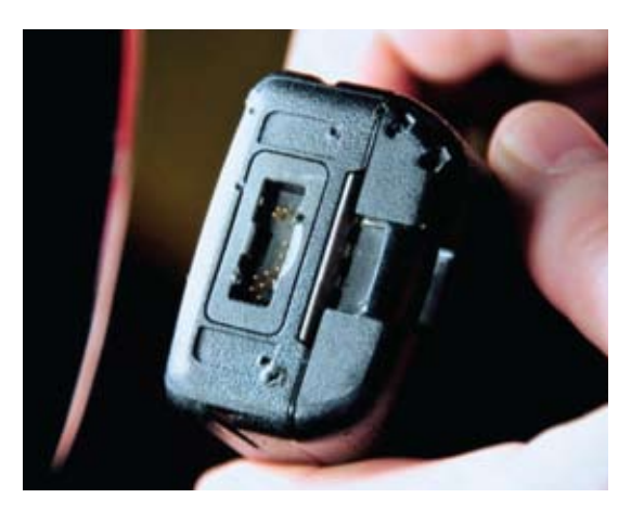
Image shows the bottom of a prototype radio after being dropped onto a bed of nails many times. You can see where the nails have impacted on the radio without bending the pins.

Minimal insertion and extraction force allows the ease of insertion into programming ports/charging cradles. The connector is capable of over 10,000 attach/detach cycles.