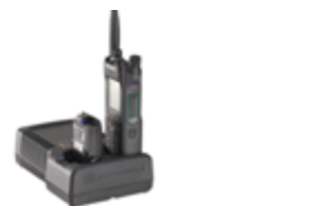
IMPRES Dual Unit Charger