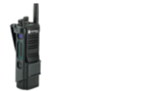
Universal Carry Holder