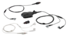
Mission Critical Wireless Covert Kit