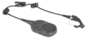
Mission Critical Wireless Earpiece