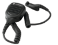
IMPRES Display Remote Speaker Microphone

The unique, dual-pocket design lets you simultaneously charge primary and secondary batteries. It provides the convenience of a spare battery that is charged and ready to be used at all times. Enjoy 43% longer battery life from IMPRES over non-IMPRES batteries – without spending maintenance or record keeping time and effort.