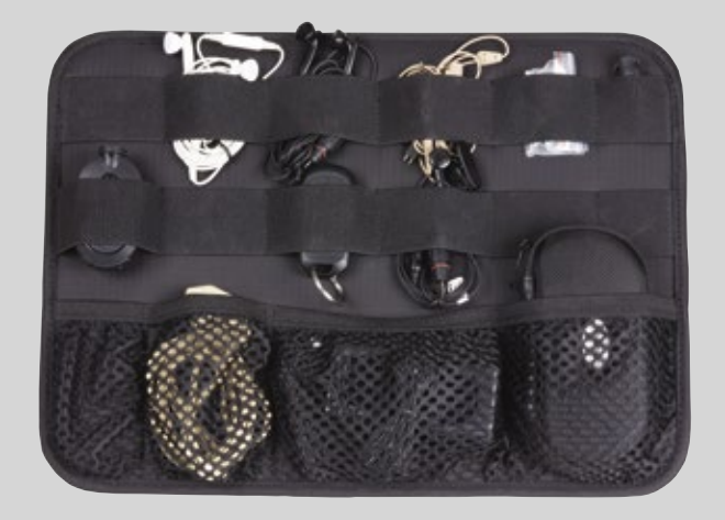
Note: Backpack not included with case