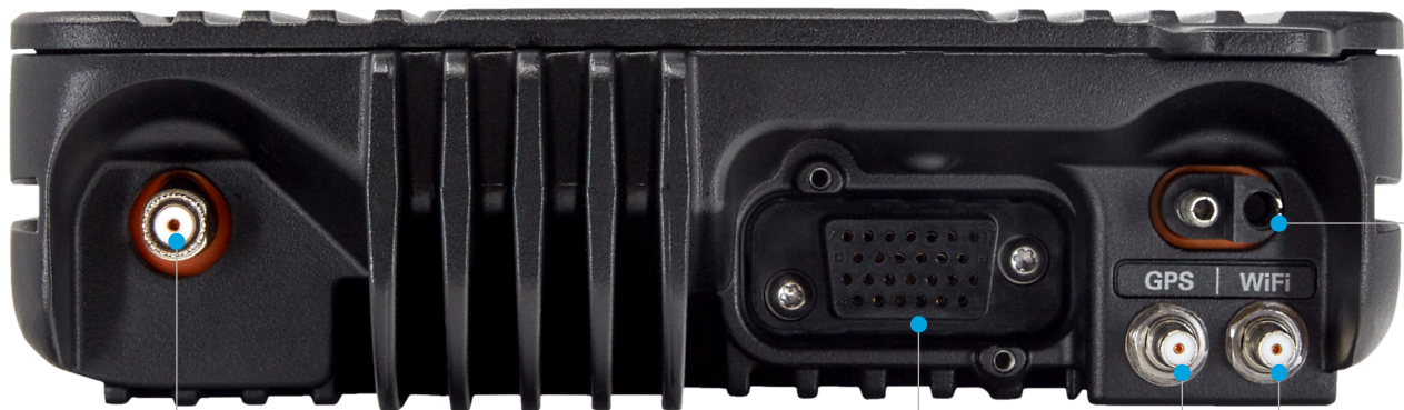
RF antenna port

The APX 2500 is ideal for many vehicle installations. Its small and lightweight form factor simplifies installation and its IP56 rating provides ample protection from dust and water intrusion.