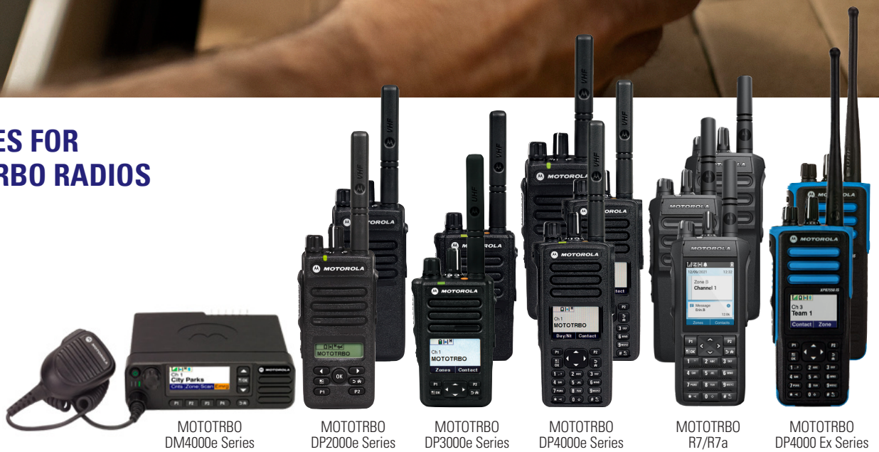
MOTOTRBO DM4000e Series