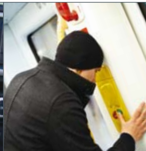
Customised Passenger Voice Terminals