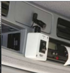
Pump Bay Voice Terminal switch