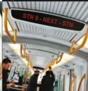
Integrated Passenger Information Systems