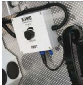
Pump Bay Voice Terminals for Fire & Rescue