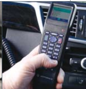
Integrated Vehicle Installations